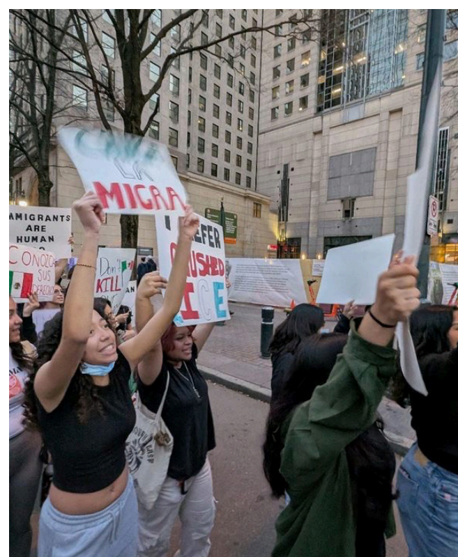
Members of Latines Unidos in uptown Charlotte protesting recent ICE raids