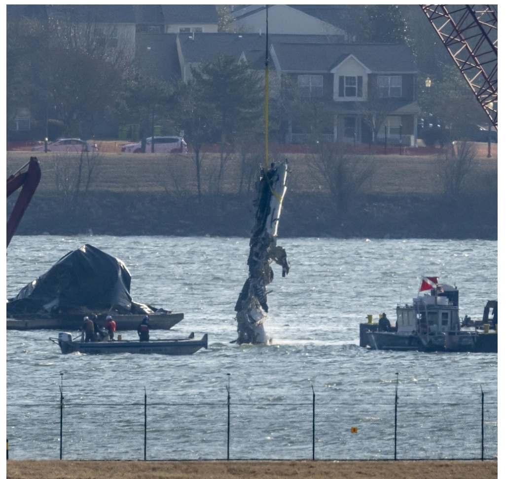
Wreckage from American Airlines Flight 5342 being pulled out of the Potomac River in Washington D.C.