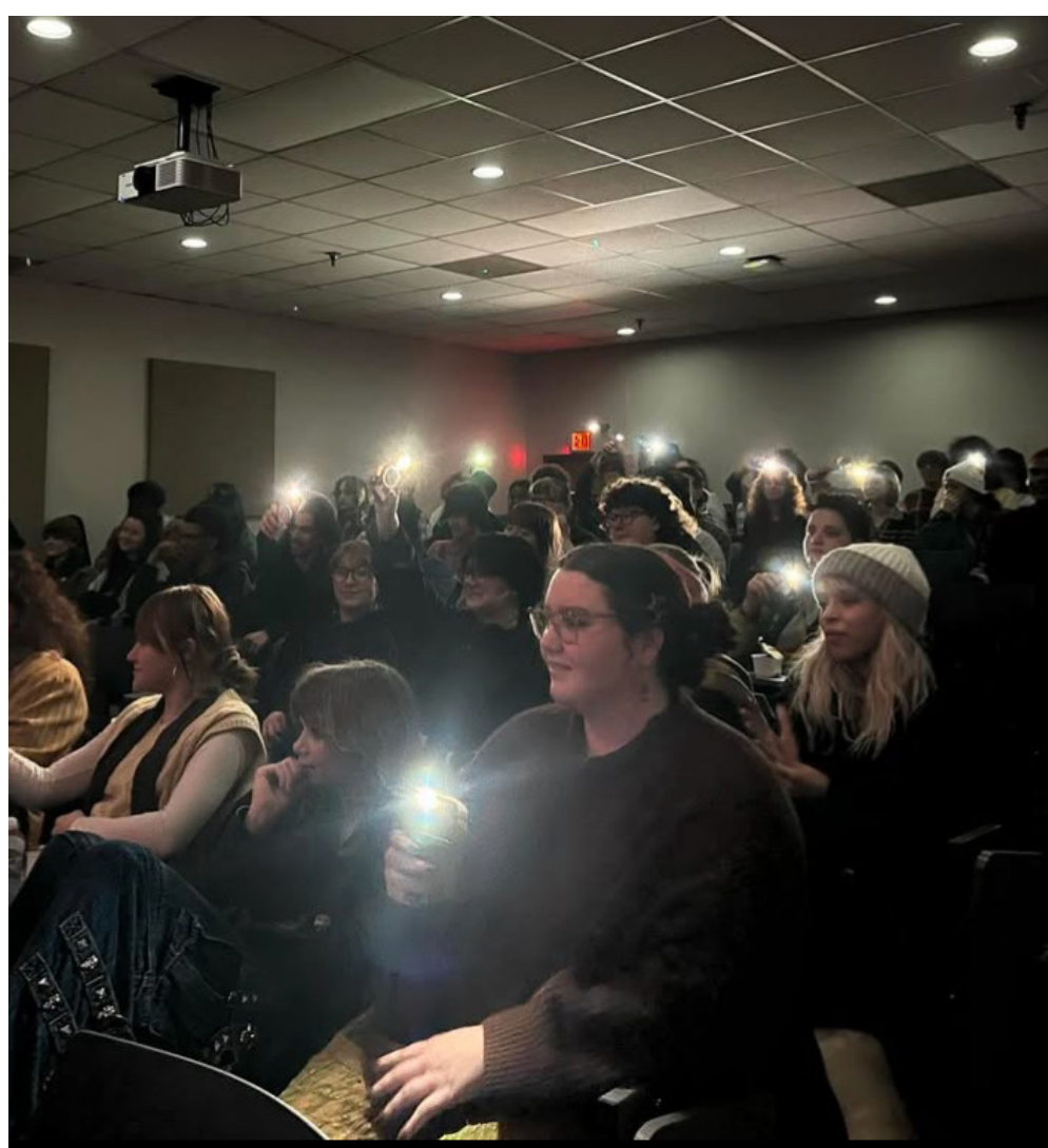
RAW open mic night

Gumangan shared that RAW hopes to make Open Mic nights a part of its monthly practices due to their