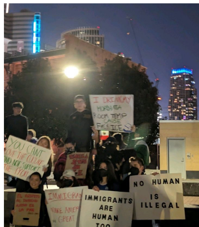
Protesters holding up their signs