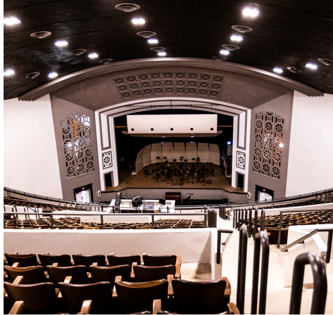
View of Byrnes from the very top