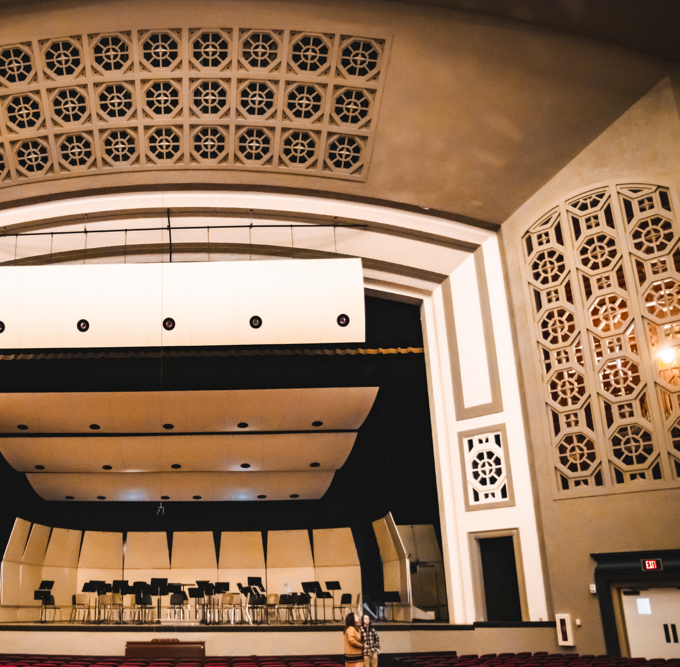
Changes made to the organ room (upper right) allows for better lighting and sound