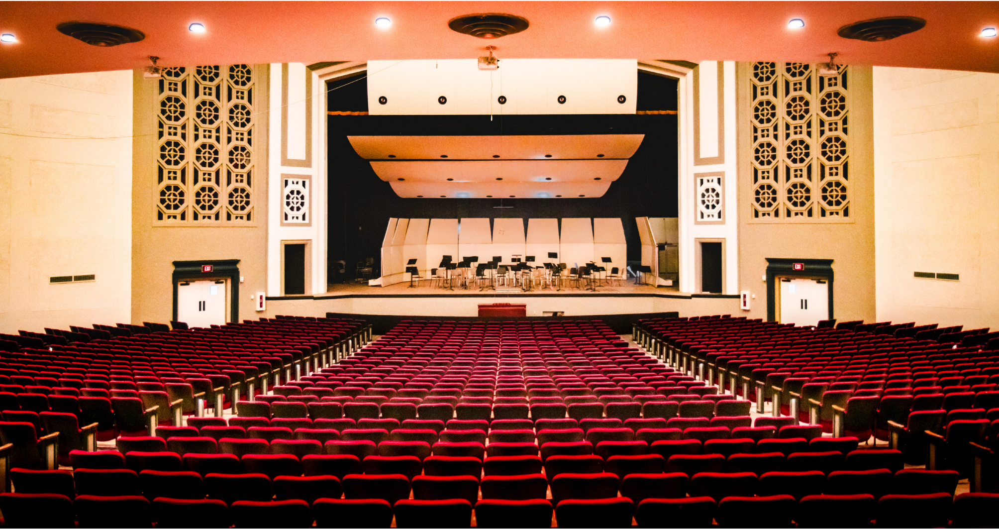
Wide shot of the inside of Byrnes auditorium