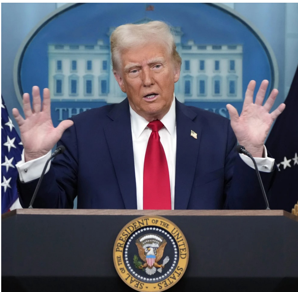
President Trump speaking at the post-crash press briefing on Thursday, Jan. 30

If we want to establish somewhat of a sense of unity as Americans we have to acknowledge the diversity based factors that make us who we are and the banning or refuting of diversity, equity and inclusion based initiatives is not a step towards attaining a modern day approach to the American dream ideal.