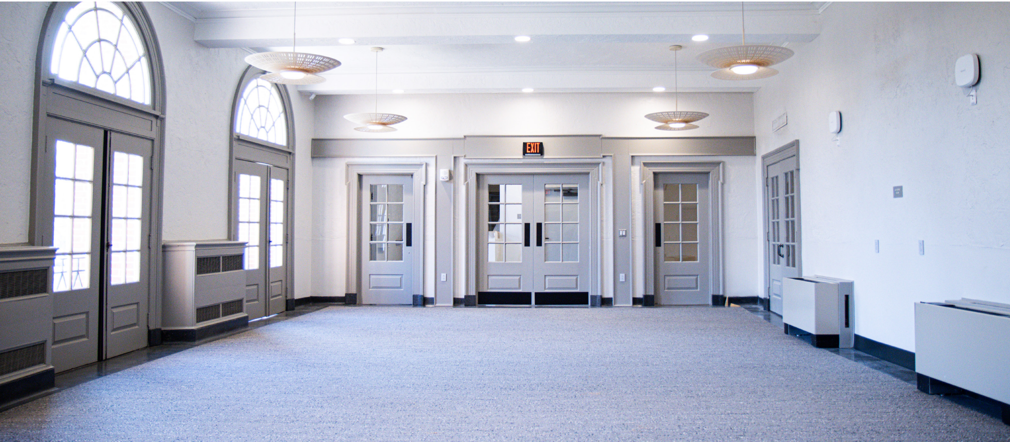
"The Gathering Room:" A brand new room added to Byrnes as a part of the renovations