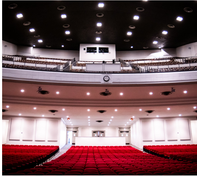
View of Byrnes from the stage, with new roof in shot