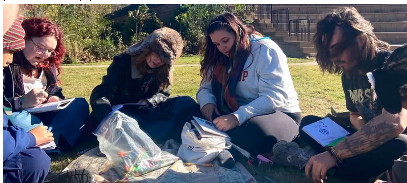
RAW club members on a “art walk” at the Riverwalk

Winthrop University’s new art club, Rising Artists of Winthrop, or RAW, provides an enjoyable creative outlet for artistic students of all varieties.